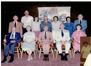
The 1974 Founders