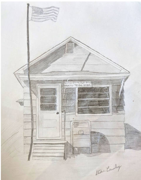
Old Gruetli Post Office Building

We were told this week that the Old Gruetli Post Office building is to be given to the Society. We plan to move it the Stoker-Stampfli Farm Property.