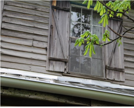
Second Floor Windows & Shutters to be replaced