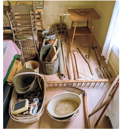
Items from the Stampfli Estate