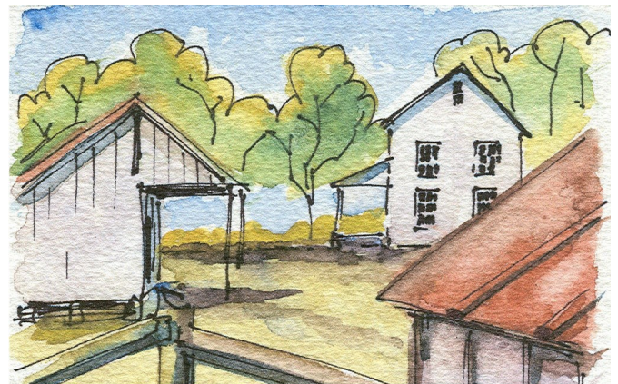
Grundy County Swiss Historical Society Stoker-Stampfli Farm Museum