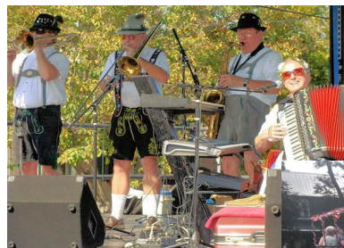
The Musik Meisters

The cost for each person over the age of 12 is $10.00 and will be collected at the gate. Remember to join The Grundy County Swiss Historical Society and help us preserve and restore this grand old historical farm.