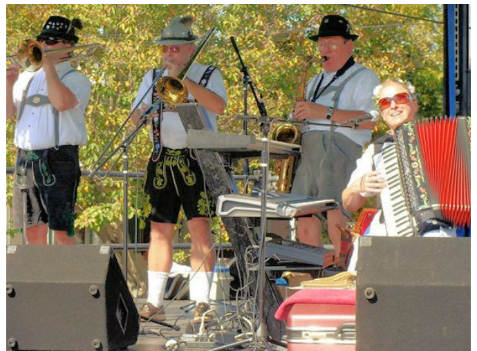
The Musik Meisters