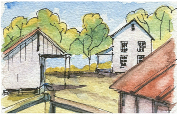
Grundy County Swiss Historical Society Staker-Stampfli Farm Museum