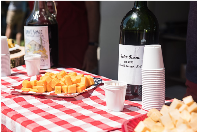
Wine & Cheese Tasting

a glimpse of what life was like for our Swiss predecessors.