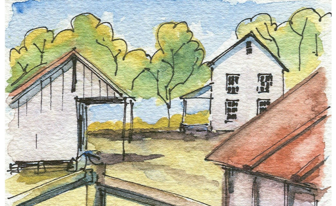
Grundy County Swiss Historical Society Stoker-Stampfli Farm Museum